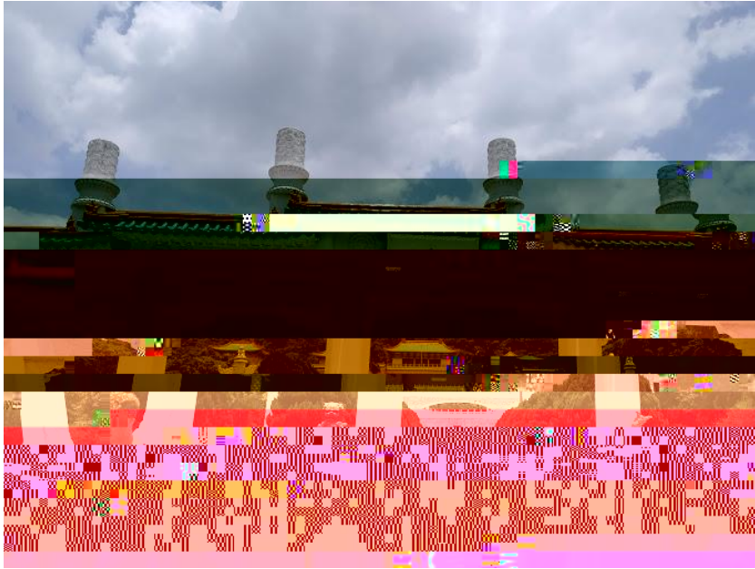
The National Palace Museum in Taipei, Taiwan