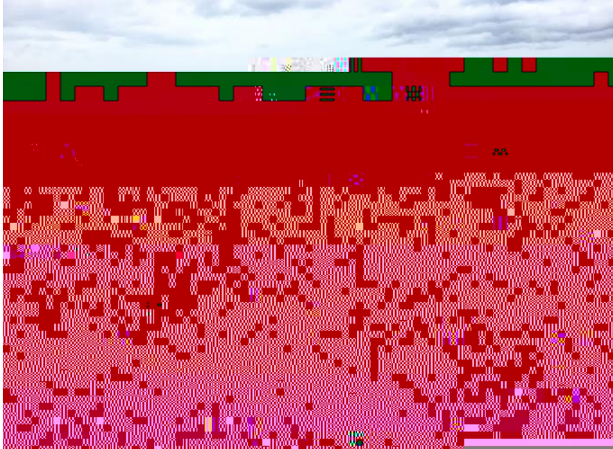
Jin Shui Mountain Roads in Jinguashi, Taiwan